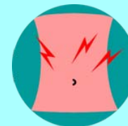
Pelvic or Abdominal Pain