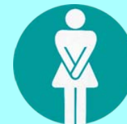
Urinary Urgency or Frequency