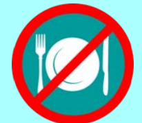
Difficulty Eating or Feeling Full Quickly