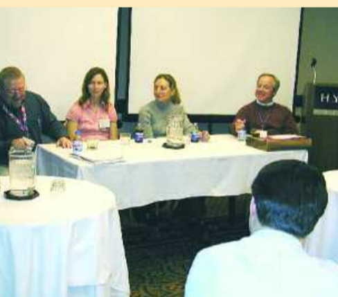
Students participated in a day experiencing the joy of family medicine.