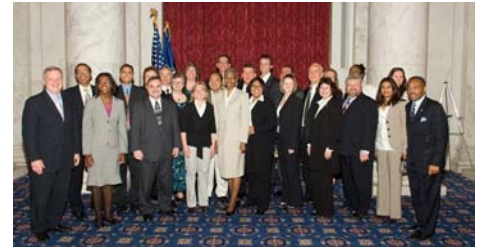
The entire IAFP delegation with Senators Dick Durbin and Roland Burris on Capitol Hill on May 21.

“There must be a greater role for family physicians and primary care doctors,” he said. “That was recently highlighted