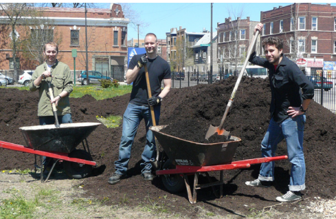
Residents start one of many community vegetable gardens planted in the Humboldt Park community.